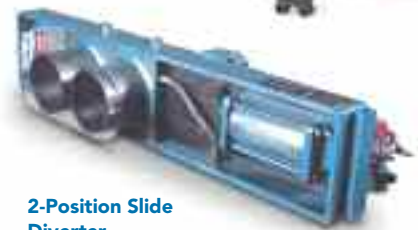
2-Position Slide Diverter • Up to 100 psi