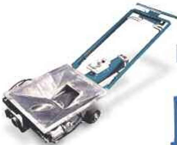
Airlift Railcar Discharge Adaptor