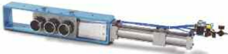
3-Position Slide Diverter • Up to 15 psi