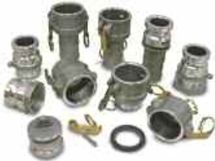
Piping, Coupling & Elbows