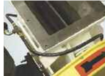
Air line to shaft seals.