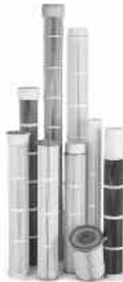
Filters & Cages