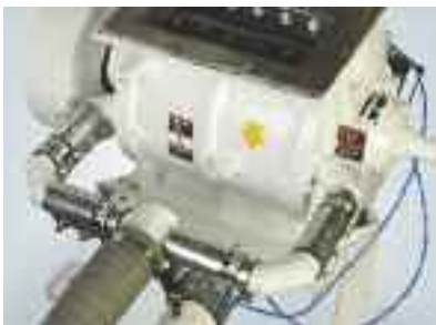
Air piping to endplates.

Smoot offers the cavity air purge process on its entire line of closed end rotary valves to reduce abrasion on the rotor, cylinder, and endplates. This patented design uses low-pressure air from the convey blower and purges the material from the cavity between the rotor shroud and the housing end plates. This air serves two purposes: to prevent the product dust from reaching the shaft packing, and, more important to the life of the overall rotary airlock, it blows off material that would attempt to settle on the top flat surface of the closed end rotor.