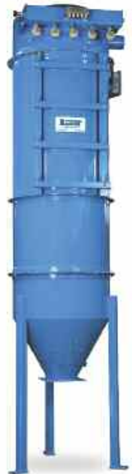
Bin Vents/Filter Receivers