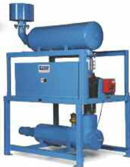
Pressure/Vacuum Blower Packages