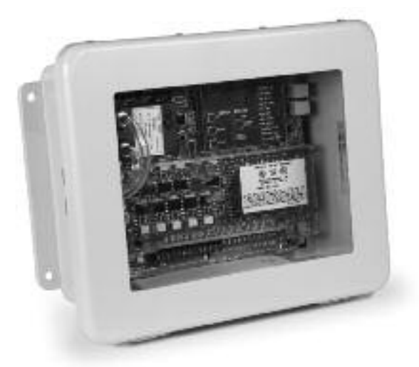
Pulse Jet Filter Timer Assembly with Integral Photohelic Switch & Gauge

Contact your Smoot Service Center representative for assurance with part identification and trouble-shooting when required.