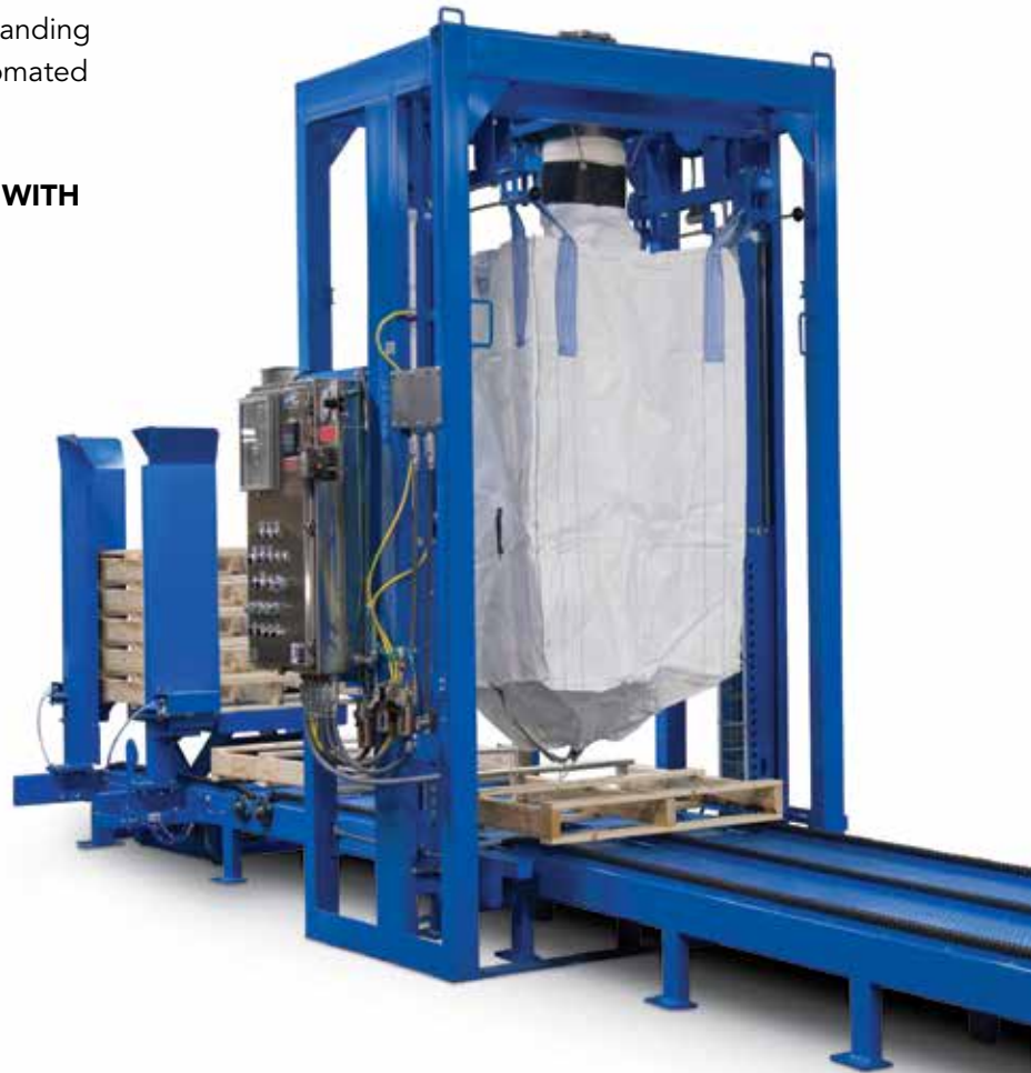
IBC-3000 shown with optional lift platform, pallet dispenser, and conveyor system.